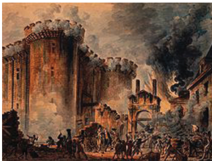
Wars and Rumors of Wars!

Mozart went on to compose many more works after Le Nozze was premiered in Vienna at the still-standing and beautiful Burgtheater. He received such acclaim for this opera that the work was also premiered in Prague. The performances in Prague also led to more collaboration between Da Ponte and Mozart including the opera Don Giovanni .