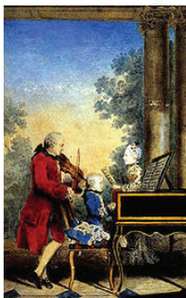
The Mozart Family Live on Tour!

At 4 years of age, Mozart showed his amazing gift for music by playing musical games with his father Leopold at the keyboard. In Mozart's day the precursor of the piano was the harpsichord. Little Mozart was amazingly adept at playing it, and was able to play sections of Johann Sebastian Bach's music as well as even improvising his own musical ideas! At age 5, little Wolfy was composing already. His first piece is less than a minute long but filled with so much promise! I don't know about you but I was only playing with marbles at age 5! His first piece is called the Andante in C (pronounced ahnDAHntay in see). Have a listen: http://upload.wikimedia.org/wikipedia/commons/3/3c/K1a.mid . Not bad for a five-year old right?